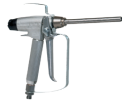
Light weight gun