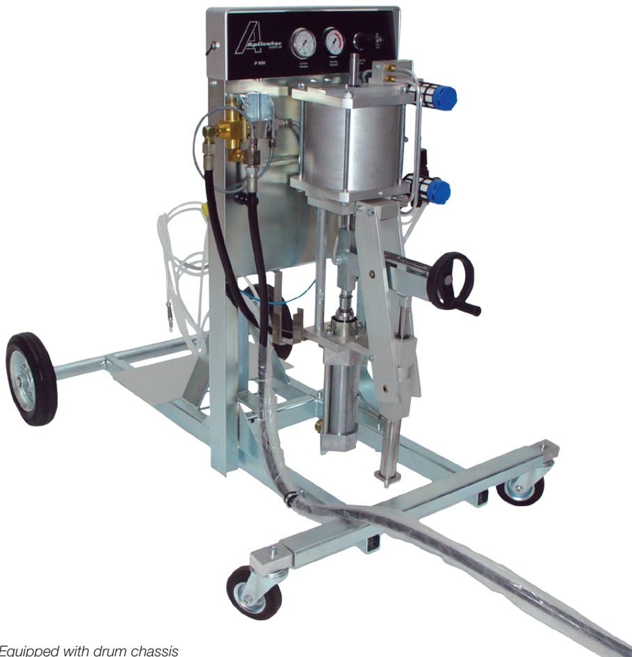
Equipped with drum chassis

– A new designed machine built on the famous IP 8000 series.