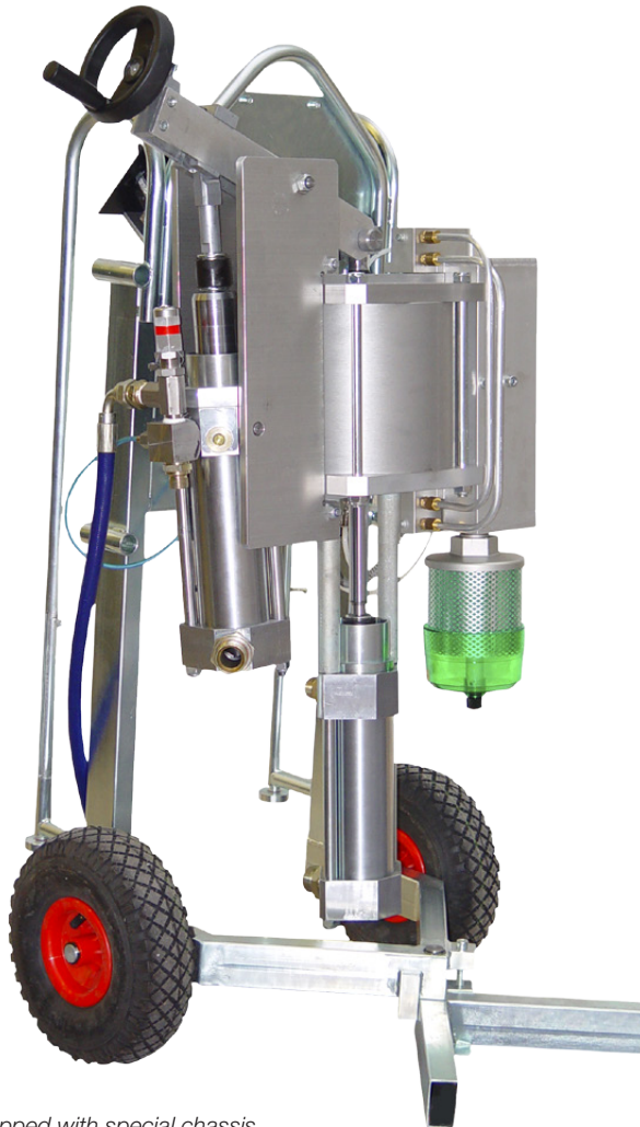
Equipped with special chassis